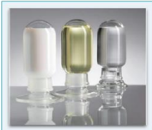
Binder for lithium-ion battery anode