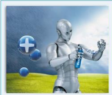
Innovative & Energy Efficient Metal Pretreatment Solutions