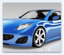
Coolants for automotive applications