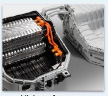
High-performance plastics for electric powertrain and battery applications