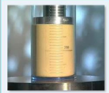
Cellasto® NVH solutions